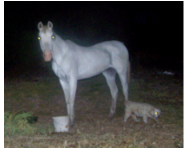
Flash in a field. Can't find an edited version with eye correction. Note: too close and wide angle distorts the perspective. This needed to be at 90° angle to the horse, a zoom from father away, or cropped to fill frame.